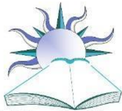
Fort Myers Beach Library

Monday - Friday 9 am to 5 pm Saturday 9 am to 1 pm